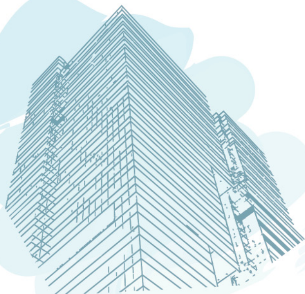
私人寫字樓 Private Office