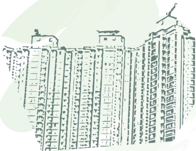
私人住宅 Private Domestic