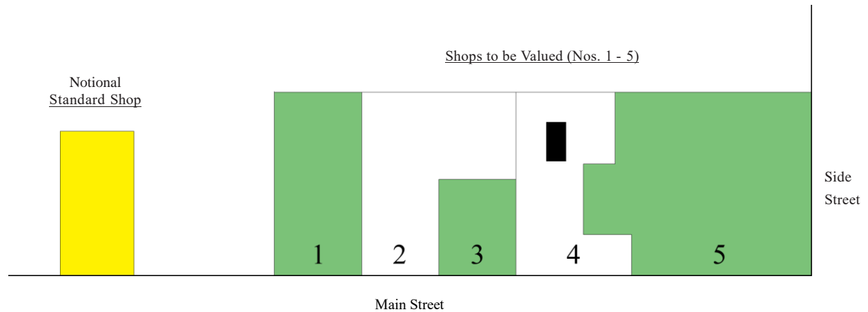
Figure : Illustration of “Standardised Shop” Approach